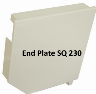
End Plate SQ 230