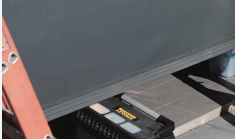
*Picture above of tool box taking the weight of the bottom bar

Motorised blind: Bring the blind up 400mm or so, place a toolbox or other obstacle under it and lower to the bottom limit to create loose fabric.