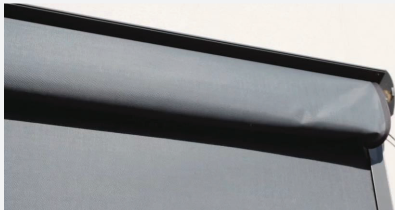
*Picture above of the slack in the fabric as the blind continues pushing down on bottom bar, which will allow the skin to slide.

The slack will allow you to slide the blind along the groove in the axle.