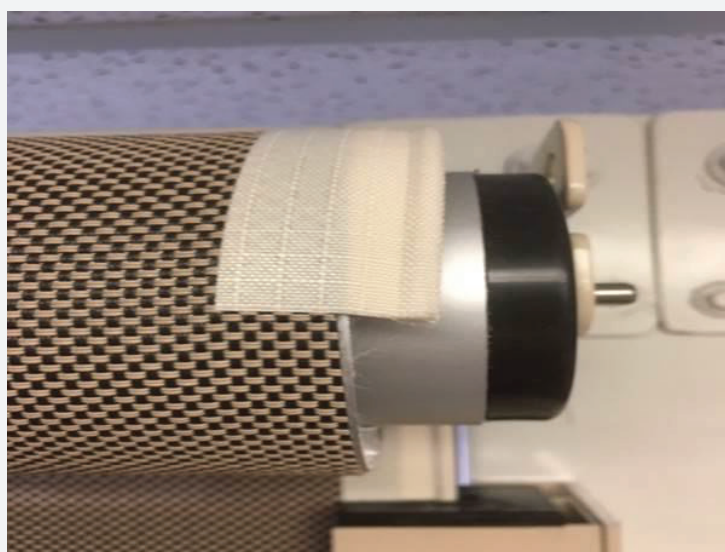
*Picture above of the slider positioned perfectly on the cut edge of the fabric

Check that the axle sliders are in line with the cut edge of the fabric. These sliders are the final key to tuning the bottom bar level. You can move the sliders inwards or outwards to adjust the balance of the bottom bar – for example, if the left-hand side of the bottom bar is sitting low, you can lower the blind to the bottom and get access to the axle, then shift the left-hand axle slider outwards towards the spline edge. You will notice that side now sits higher as you roll it back up. Continue to adjust both sliders until the bottom bar is level.